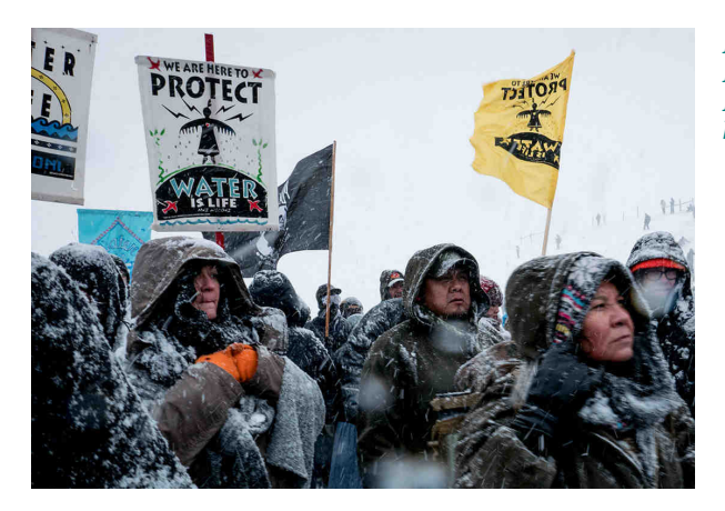
Protesters oppose the North Dakota Access Pipeline during a blizzard.

The Montana Constitution expressly guarantees the right of the people to peaceably assemble or protest governmental action. Montanans are free to gather in traditional "public forums" such as streets, sidewalks, and parks, and the government may not place unreasonable restrictions on the exercise of Free Speech rights.