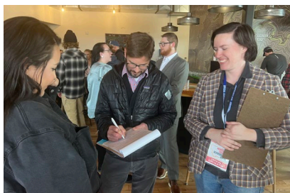
ACLU of Montana staff signing MSRR petition at campaign launch party.

To that end, MSRR made history by collecting over 117,000 signatures the most signatures for a single ballot initiative in Montana history. Montana, along with Missouri, Arizona, Colorado, Maryland, New York and Nevada, all passed ballot